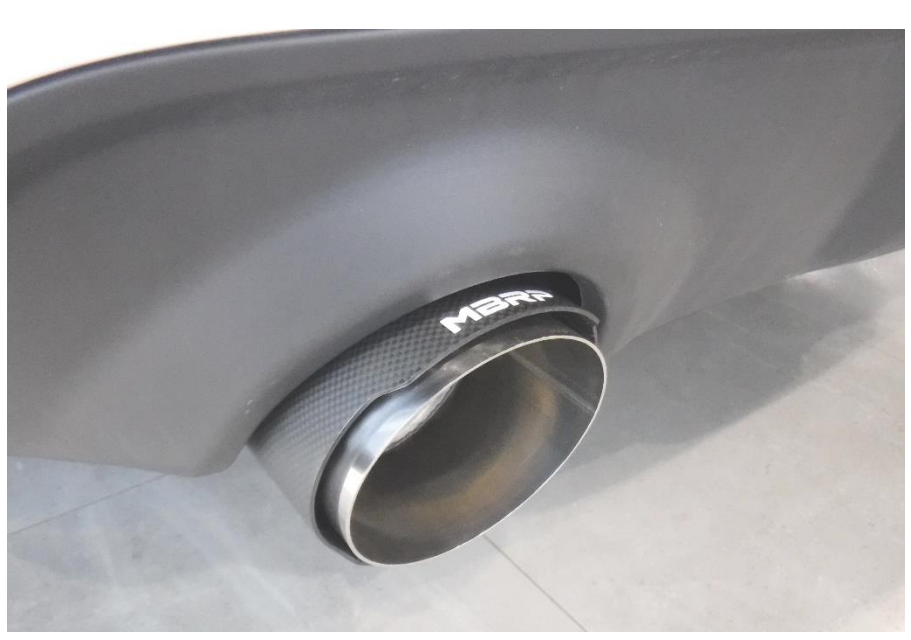
Congratulations! You are ready to begin experiencing the improved appearance of your MBRP Exhaust Tips. We know you will enjoy your purchase!

4. Verify that all hardware is tight and the Exhaust Tips are fully secure with even clearance from the fascia.