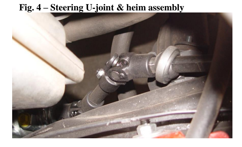
Step 4: Reinstall steering components and tighten all necessary setscrews and mounting bolts.

Carefully cut the end off the factory steering shaft (right behind u-joint at steering box) being careful not to turn the steering wheel. Slide provided heim joint over steering shaft and insert into supplied mounting bracket with lock nut above and below bracket to allow for adjustment. Insert steering shaft into u-joint and tighten setscrew. Clamp heim support bracket to frame and rotate steering to check for binding. If binding occurs slowly trim factory steering shaft and continue fitting until there is no binding in the steering linkage. Once fitment has been completed tack weld support bracket to frame. Again verify that there is no binding, once satisfied, finish welding the heim joint support bracket.