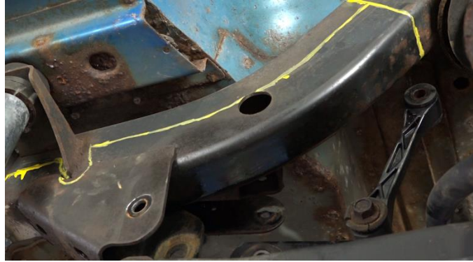
Depending on how you intend to cut, clean the cut zones free of rust and down to bare metal.

Mark down 1.5 inches from the top of the frame rail, on the inside and outside. You will need to cut off the frame side upper control arm mount on the inside of the frame rail.