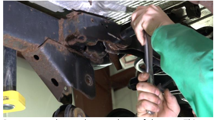
Rotate control arms down and out of the way. This may require you to loosen the axle side bolts.