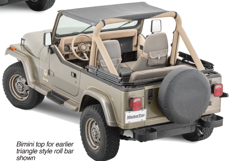
Bimini top for earlier triangle style roll bar shown