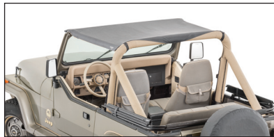
Bimini Top: For 1987-1995