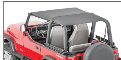
Bimini Top Plus: for 1992-1995