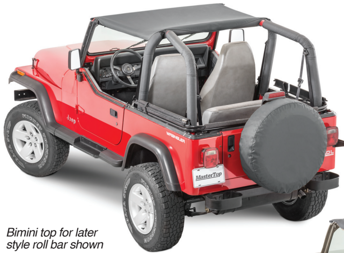
Bimini top for later style roll bar shown