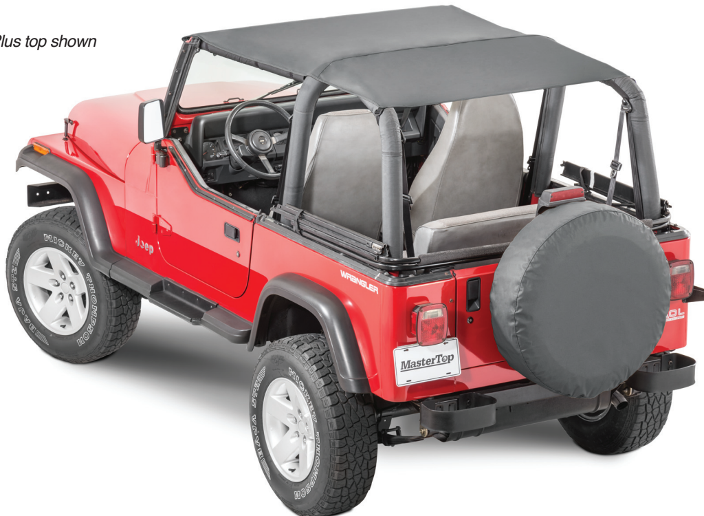
Bimini Plus top shown

Make sure the rear tension straps DO NOT interfere with rear seatbelt operation.