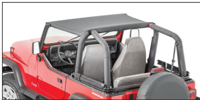
Bimini Top: For 1987-1995