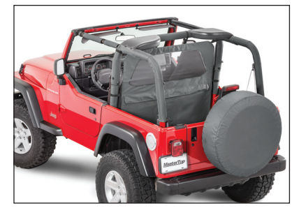
Wind Stopper: For 97-06 (TJ)