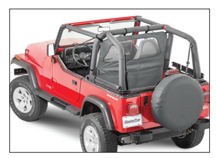
Wind Stopper: For 92-95 (Later YJ)