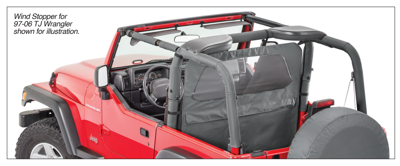
Parts List: Wind Stopper - QTY 1

Items #14407015, #14407035 and #14407037