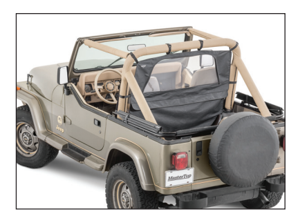
Wind Stopper: for 80-91 CJ & YJ