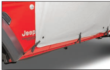
Protects Door Openings