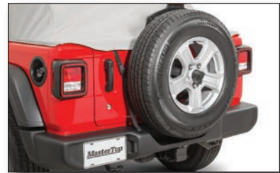
Easy on, Easy Off!