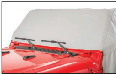
Keeps the heat out!