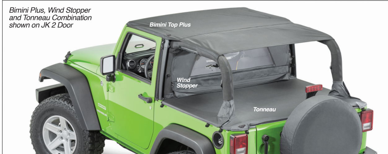
Bimini Plus, Wind Stopper and Tonneau Combination shown on JK 2 Door