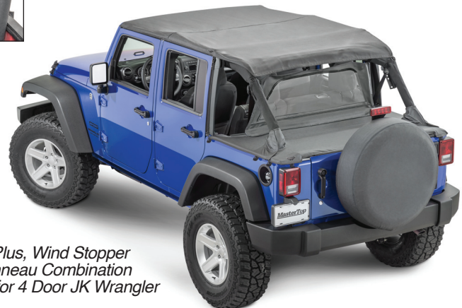
Bimini Plus, Wind Stopper and Tonneau Combination shown for 4 Door JK Wrangler