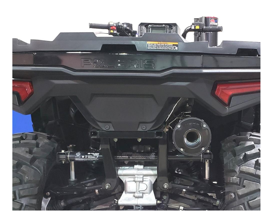
Congratulations! You are ready to begin experiencing the improved performance and driving excitement of your MBRP ATV Exhaust upgrade. We know you will enjoy your purchase.

It is recommended that the muffler screws (tip and endcap) be retightened after the first ride and checked periodically thereafter, tightening if necessary.