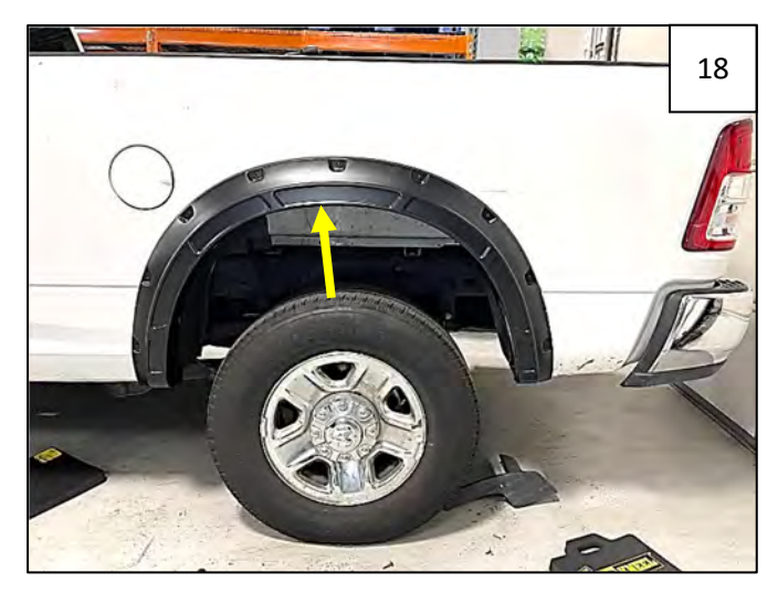
Align flare on fender. Using a Philips screwdriver, start supplied Truss Head Screw through flare and into clip installed in Step 17.