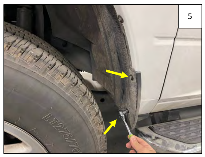
Remove 2 factory screws from mud flap. Fasteners will be reused. Do not remove fastener above mud flap. Pull mud flap towards you to remove – it's held on with 2 hidden plastic clips.