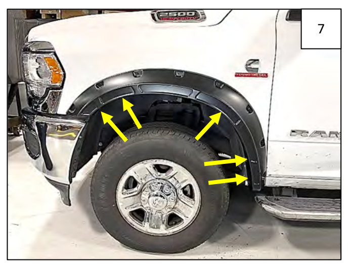
Align flare with vehicle. Start 5 factory screws through holes in flare and into factory holes.