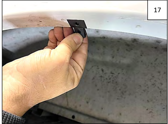
Slide a supplied "U" Clip over the mounting tab centering over the hole made in Step 16.