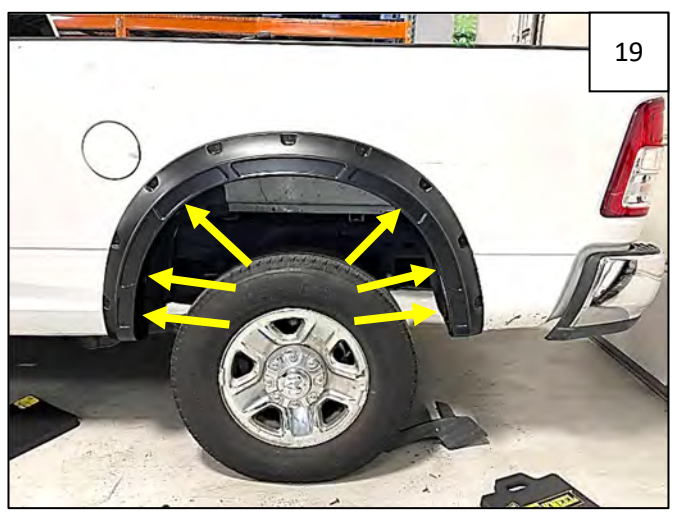
Install 6 retained factory screws through remaining holes in flare and into factory holes in fender.