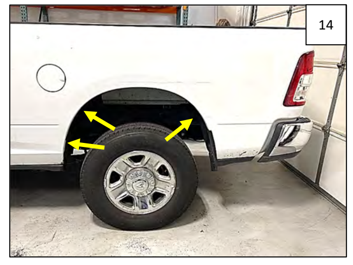
Remove and retain 3 factory screws.