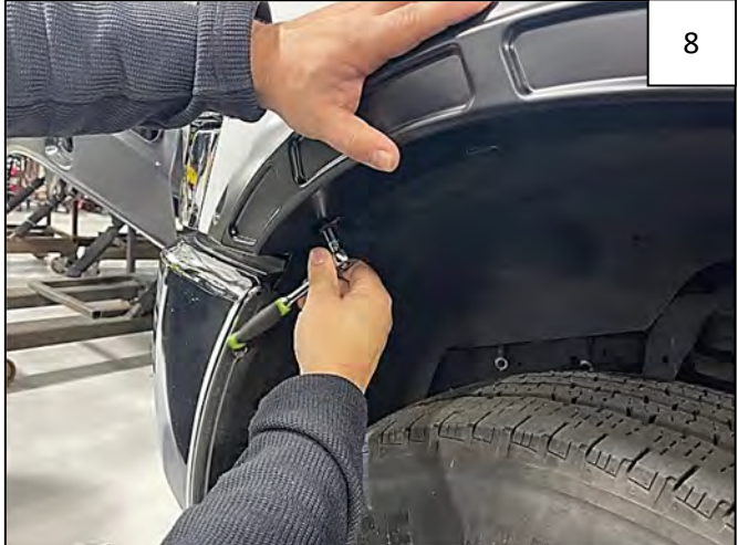
Press inward on flare to apply pressure to the flare and tighten all screws.