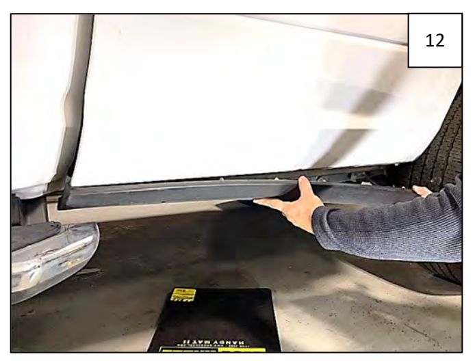
Pull underside trim off. Pull until plastic clips release. Clips may break in the process. Discard trim.