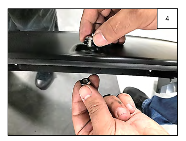
Place a supplied Pocket Nylock Nut over the end of each bolt and tighten using a 1/2" wrench for the Nut and the supplied T-45 Torx Bit for the Bolt. Repeat for all pockets.