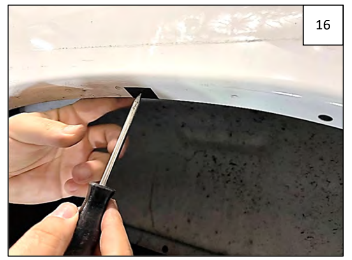
Using an awl, pierce Mounting Tab into the factory hole underneath.