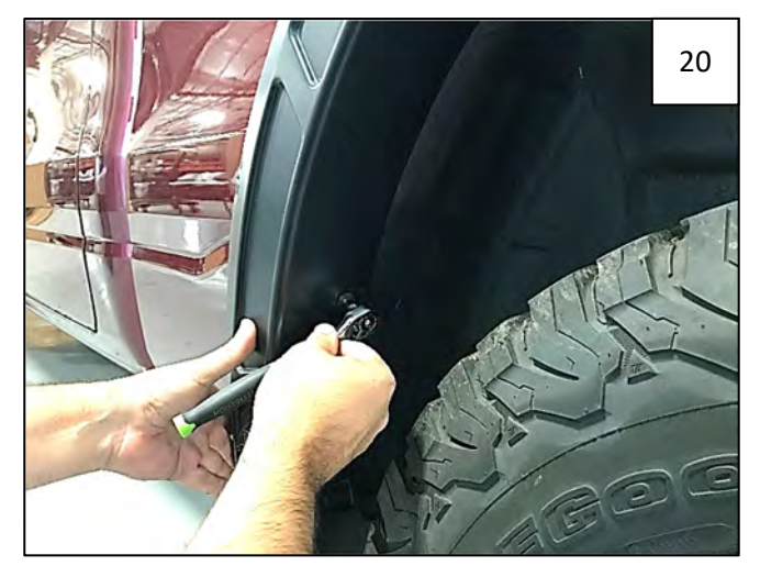
Press inward on flare to apply pressure and tighten all screws.