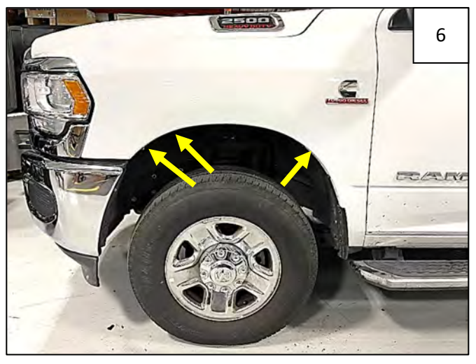
Remove and retain 3 factory screws as shown.