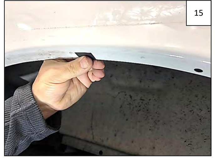
For topmost hole in wheel well, peel liner from a supplied Mounting Tab and center over the factory hole. If vehicle had full wheel well liners, no tab or clip is needed – just reuse factory fastener.