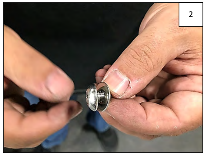
Install a supplied SS Pocket Washer onto each SS Pocket Torx Bolt.