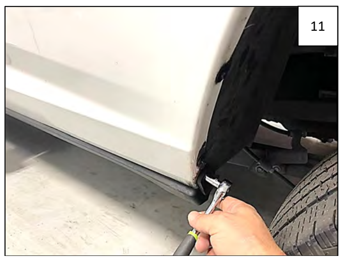
Using an 8mm socket, remove and retain factory screw at front of rear wheel well (this screw holds the underside trim on vehicle at wheel well).

If vehicle is equipped with full fender liners, remove top most factory screw at top of fender; retain for reuse. If vehicle is not equipped with fender liners, proceed to Step 11.