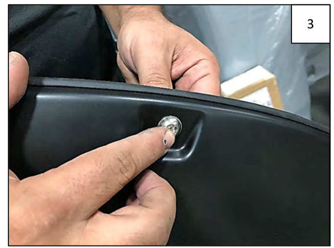
Insert each Bolt/Washer combination through pocket holes in flare, Bolt head and Washer on the outside.