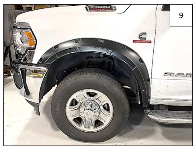
Complete Front Flare Installation.