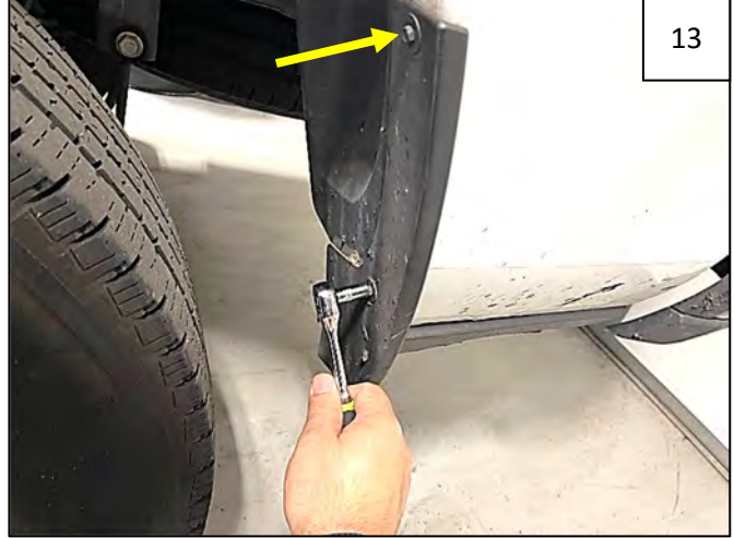
Using an 8mm socket, remove 2 fasteners at rear mudflap. Retain factory screws. Pull until plastic clips release.