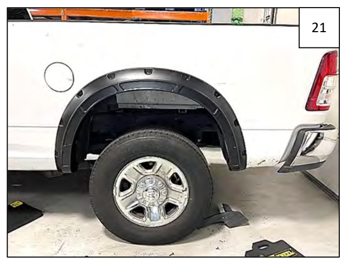
Complete Rear Flare Installation.