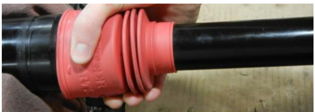
Figure 6: Bellow Seal Removal

6. Apply grease to the small end seal positioning groove shown in Figure 7. Slide the new bellow seal down the tube until the positioning ribs on the seal snap into the seal positioning grooves on the machined tube and barrel.