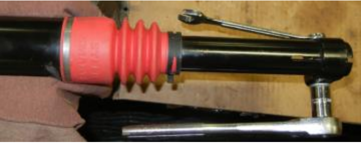
Figure 1: Bolt & Nut Removal

3. The clamp will need to be removed from the tube in order to remove the bellow seal therefore the clamp will need to spread open as shown in Figure 2. A metal cylindrical object (a deep well socket is used here) will need to be compressed into the V of the clamp using a vice or a press in order to force the clamp ears apart only enough until the tube can be slid out of the clamp (do not overspread clamp ears).