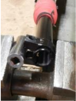
Figure 2: Clamp Removal

tube. Keep this band clamp as it will be used for the installation of the new bellow seal. Using a pair of snips or wire cutters, twist and break off the band