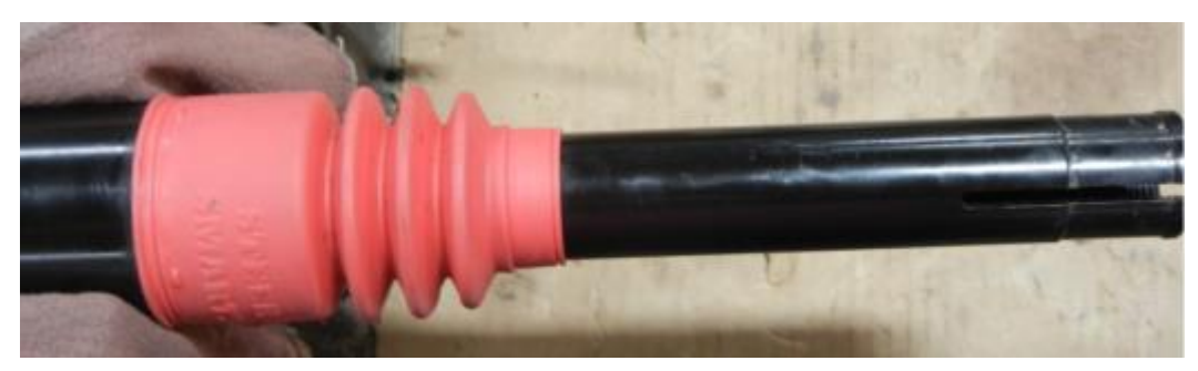
Figure 5: Bellow Seal Removal

5. The assembly should now be free of hardware allowing the bellow seal to be pulled down the end of the tube and removed as shown in Figure 5 and Figure 6.