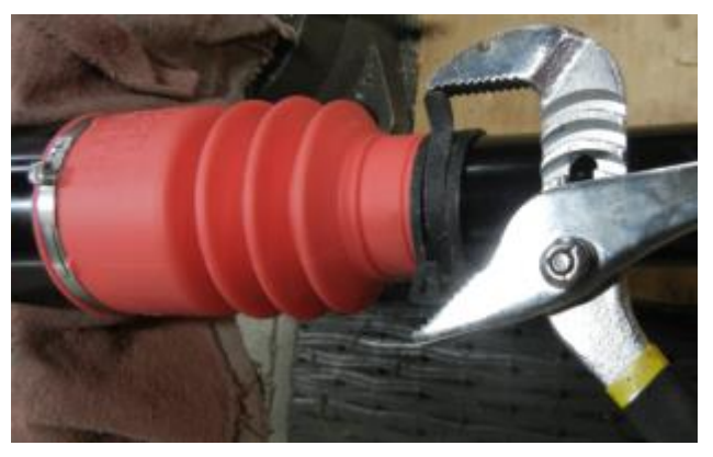
Figure 12: Constant Tension Band Clamp

8. Next replace the constant tension band clamp that was removed in step 3 using a pair of channel locks or pliers as shown in Figure 12.