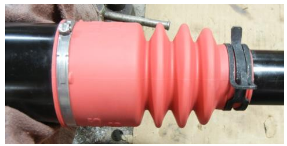
Figure 13: Completed Bellow Seal Assembly