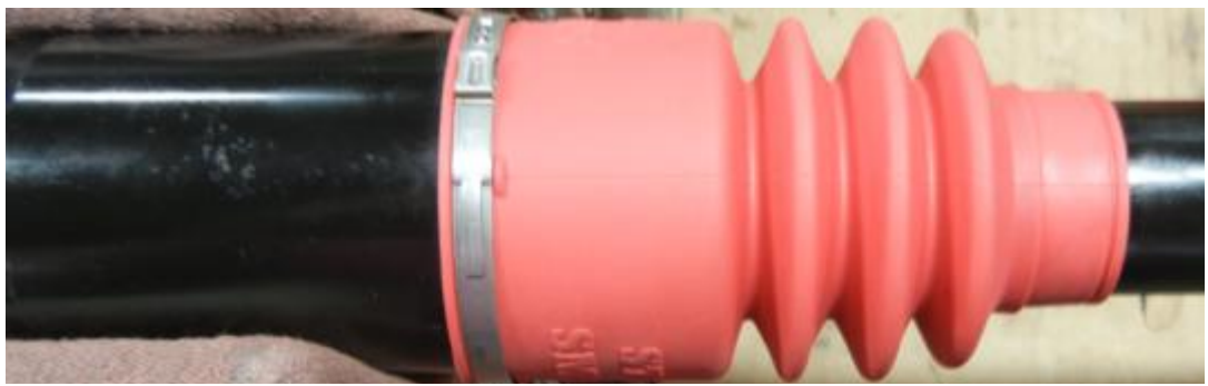
Figure 9: Band Clamp Positioning

7. Slide the supplied band clamp over the bellow seal, and then position the clamp between the bottom lip and the positioning tabs of the bellow seal shown in Figure 9. Once the clamp is positioned appropriately; crimp the band clamp tab from both sides using a pair of snips as shown in Figure 10. This will pull the band tight and disallow the bellow seal to move from the positioning groove. Do not over crimp or under crimp the band clamp. Crimp the tab of the clamp until the bellow seal is no longer free to twist around the barrel and then stop as shown in Figure 11.