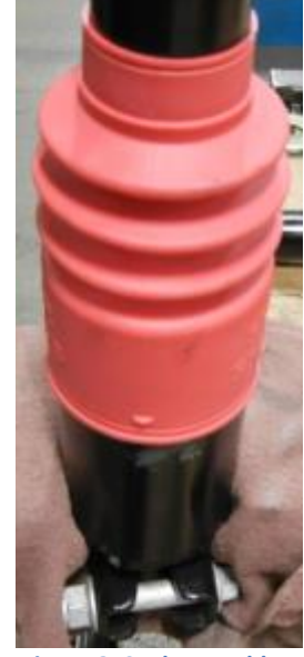
Figure 8: Seal Assembly