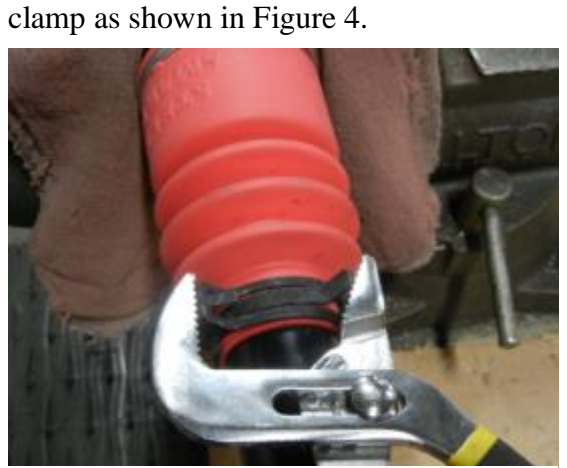
Figure 3: Constant Tension Clamp Removal