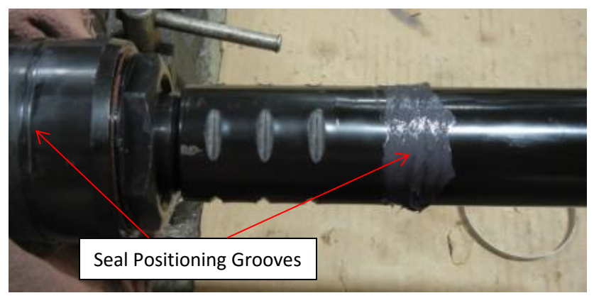
Figure 7: Grease Application for Seal Positioning Groove

6. Apply grease to the small end seal positioning groove shown in Figure 7. Slide the new bellow seal down the tube until the positioning ribs on the seal snap into the seal positioning grooves on the machined tube and barrel.