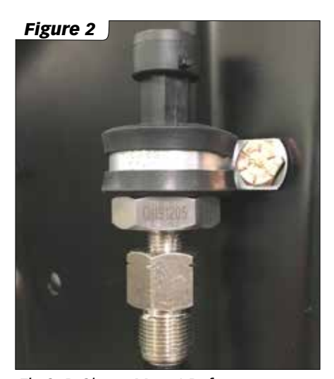
Fig 2: P-Clamp Mount Reference