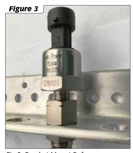
Fig 3: Bracket Mount Reference