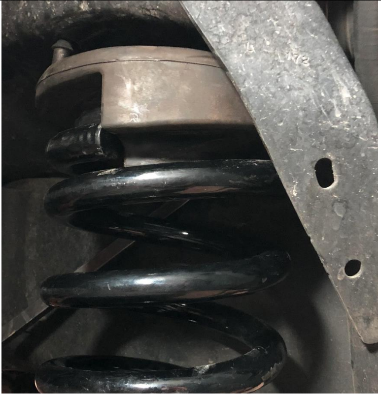
Figure 2. Synergy Leveling Spring Installed, Spring Isolator Not Fully Seated