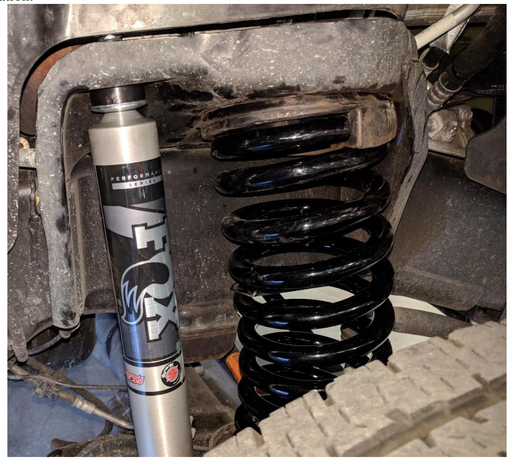
Figure 4. Front Shocks and Springs Correctly Installed

9. Once the springs are properly seated, install the Synergy front shocks. Install the stud top first, with a large washer against the shock body, then a rubber isolator, then insert the shock through the shock tower hole, then another rubber isolator, a large washer, and finally the nylock nut. The hardware requires a <sup>3</sup>/<sub>4</sub>" or 19mm wrench. As before, a ratcheting wrench makes installation easiest. Tighten the top nut until about 5/8" of thread is showing above the nut. Figure 4 shows the completed installation.