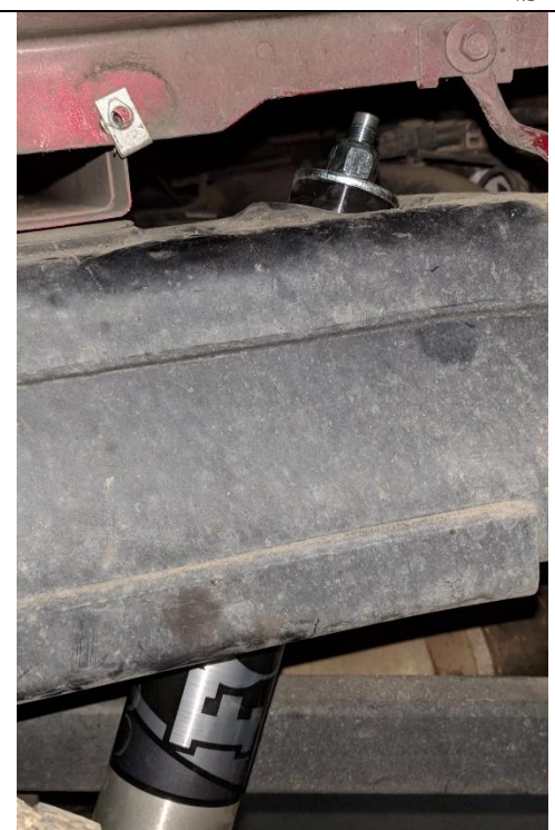
Figure 6. Completed 2500 Rear Shock Installation (Fender Liners Not Installed)