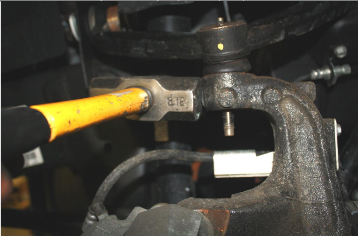
Figure 1: breaking ball joint loose from spindle