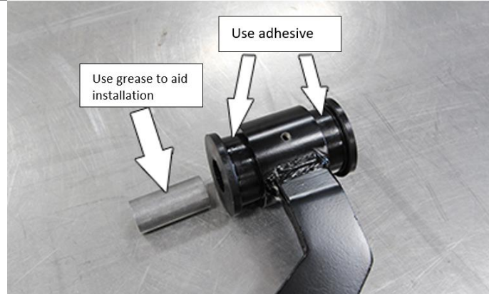
Figure 3: bushing and crush sleeve installation