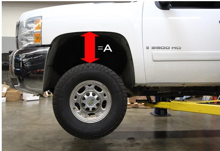
Figure 5: Distance between top of tire and fender lip.