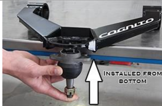
Figure 2: ball joint installation